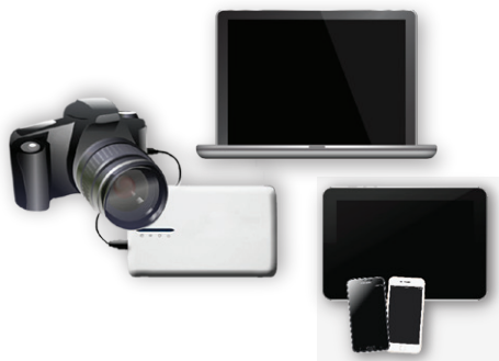
Capture Device of Your Choice