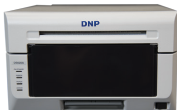
DNP Printer and WPS Pro